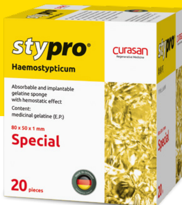
Product example stypro®

The information on the products and/or procedures contained in this document is of a general nature and does not represent medical advice or recommendations. Since this information does not constitute any diagnostic or therapeutic statement with regard to any individual medical case, individual examination and advising of the respective patient are absolutely necessary and are not replaced by this document in whole or in part.